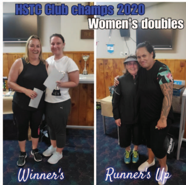
HSTC Club champs 2020 Women's doubles