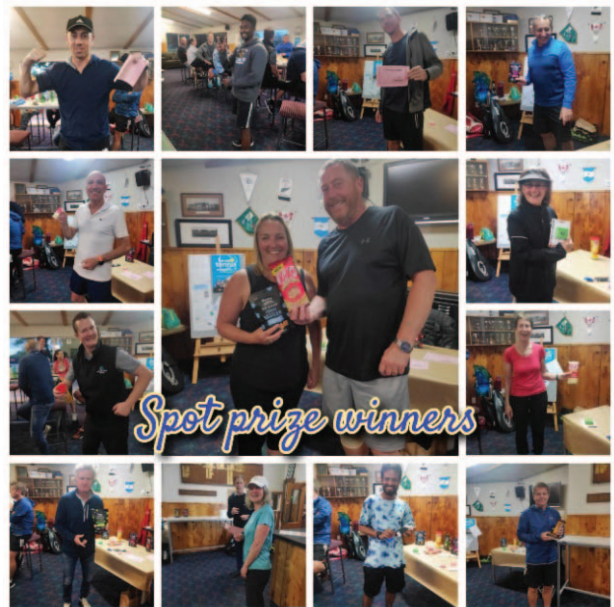
Spot prize winners