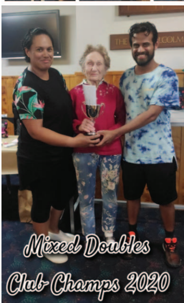
Mixed Doubles Club Champs 2020