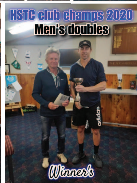
HSTC club champs 2020 Men's doubles